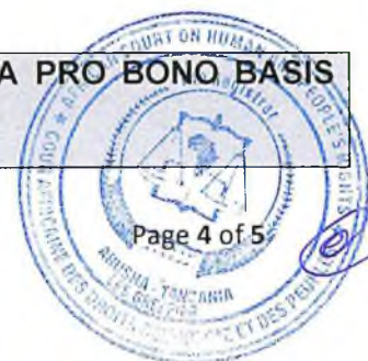
TABLE B- COUNSEL REGISTERED TO PROVIDE LEGAL AID ON A PRO BONO BASIS UNDER THE AFRICAN COURTS LEGAL AID SCHEME