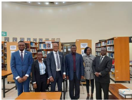
Librarian receives the High Commissioner of Namibia to Tanzania (3 rd left)

This was followed by another visit by the High Commissioner of the Republic of Namibia on 8 June 2021. The ambassadors were impressed by the status of the Library and asked that it be open to the public. The Librarian explained that the library already admits the public to use its resources.