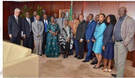
The R10 Experts on AU New Recruitment System