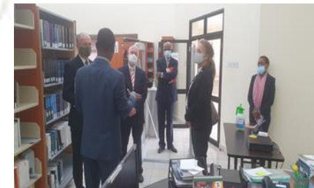
Librarian receives the EU ambassadors