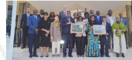
Launching of the African Court strategic plan 2021-2025